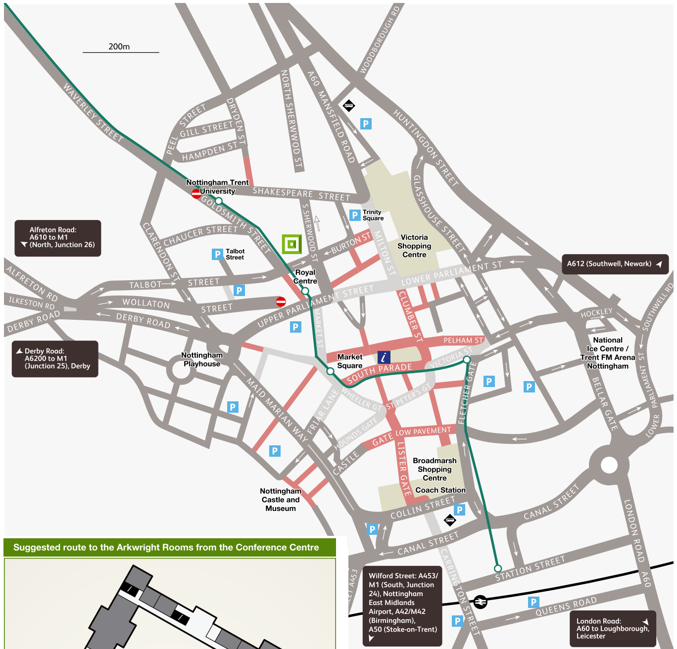
Suggested route to the Arkwright Rooms from the Conference Centre