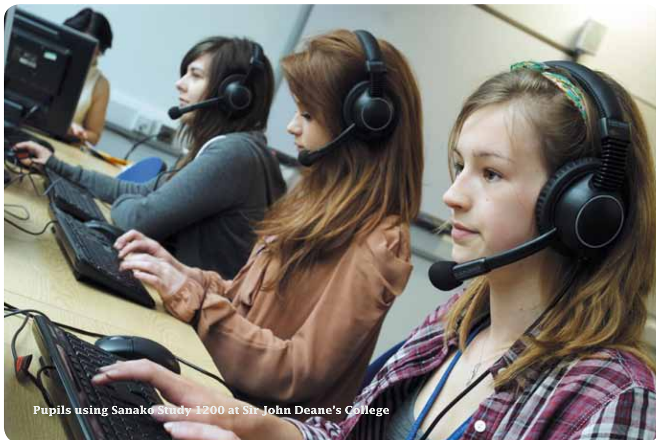
Pupils using Sanako Study 1200 at Sir John Deane's College

Stay in control with features such as Internet blocking and Application control