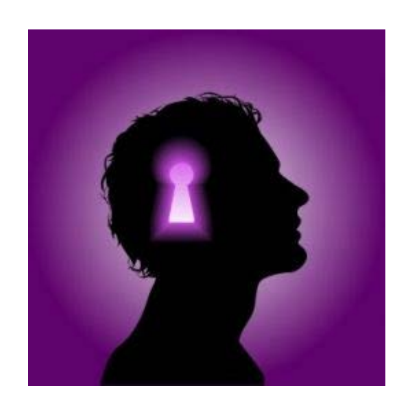
Rachel Hawkes Language World 2015