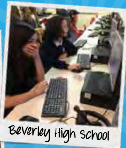
Beverley High School

Fun, engaging and above all featuring real language, this is definitely a pupil-favourite"