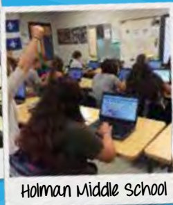
Holman Middle School