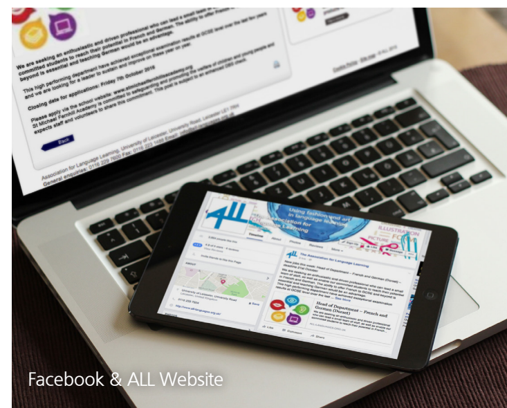
Facebook & ALL Website