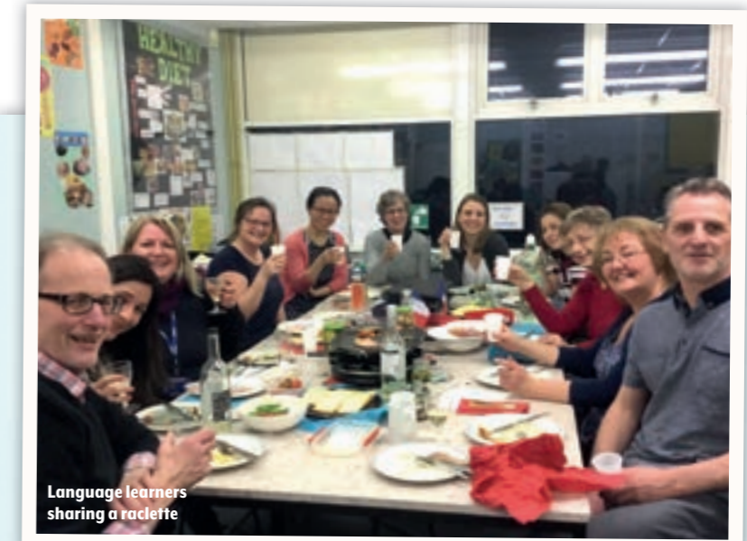
Language learners sharing a raclette