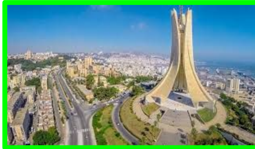
مَقَام الشَّهِيد - العَاصِمَة