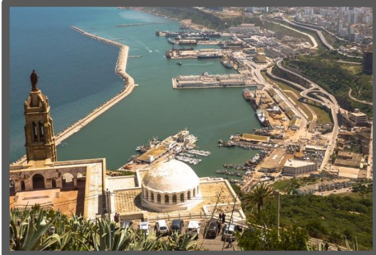
لالَة مَرِيَّامَة - وَهْرَان