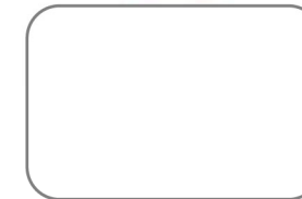
United Arab Emirates