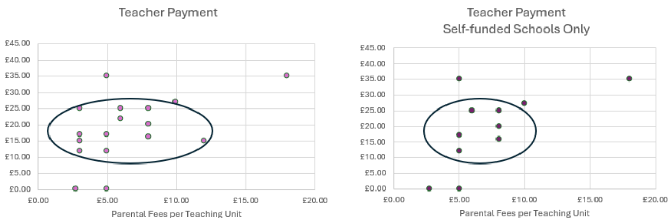
Fig: Comparison of Amount of Parental Fees and Teacher Payment

And indeed, a direct comparison of the amount of parental fees with the amount of payment to the shows that the majority of schools fulfil both conditions.